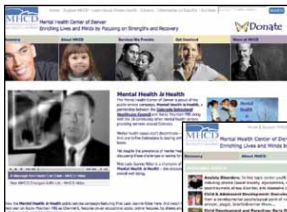
Left: client's original page, Below: content on the Centersite hosted page matches the existing website.